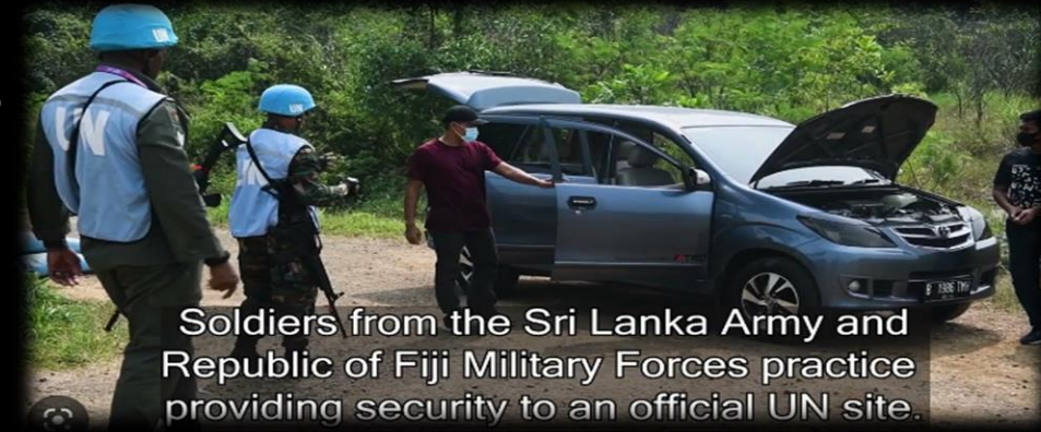
Soldiers from the Sri Lanka Army and Republic of Fiji Military Forces practice providing security to an official UN site.